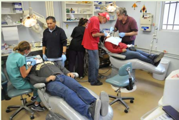
Dental was busy all day

We left the hotel for Mama's Restaurant at 8 in 3 vans having just gotten the third one working. We had a very nice breakfast and got the clinic open a little after 9. The courtyard was full with patients waiting for dental and medical. We started seeing patients but at some point in the morning we ran out of water. That should not have happened since the clinic's cistern on top of the roof should have been full, having been supplied water from the city. There had to be a leak. It was the hard work of Randy, Carl and Sam that found a broken pipe in the patients' bathroom toilet. This was clearly the problem and what also caused us to run out of