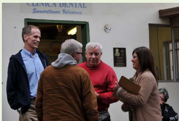
A rare photo of me at the clinic